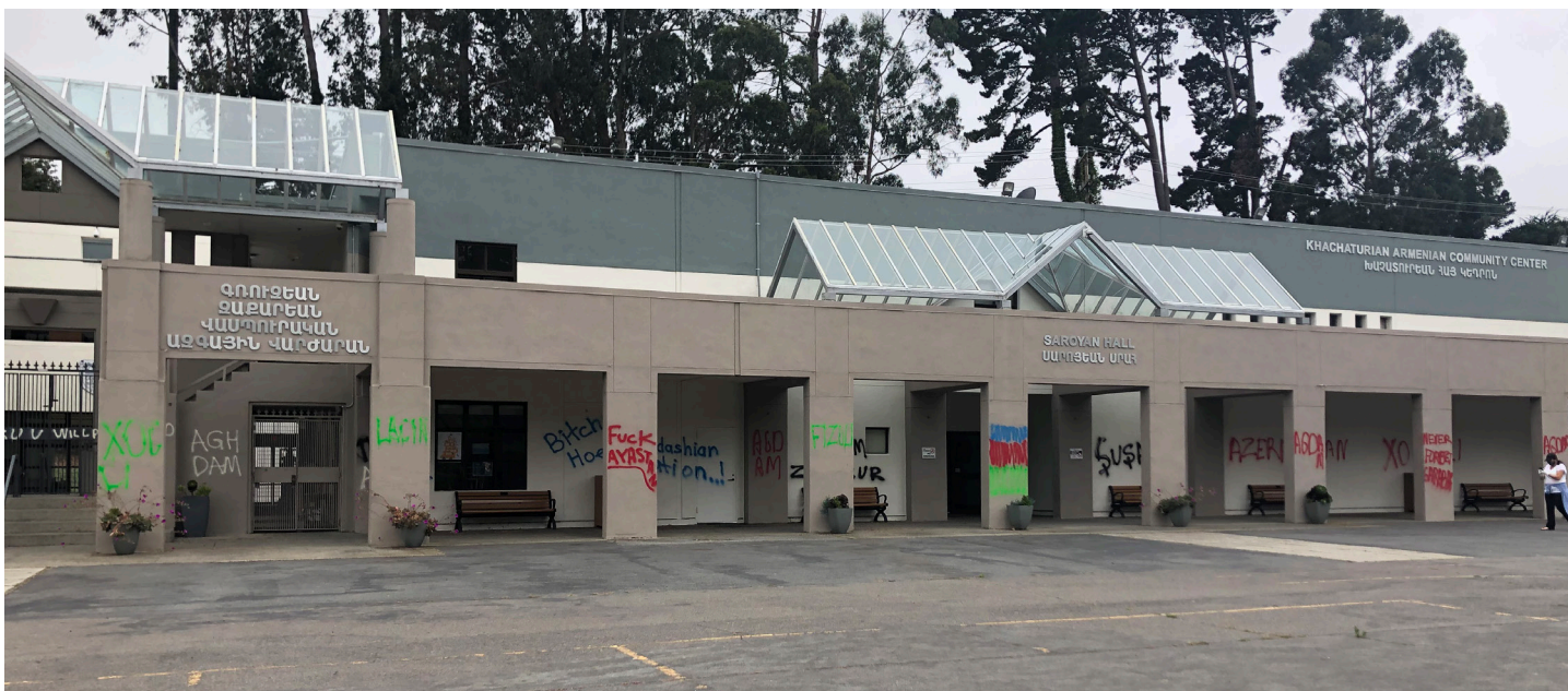
Graffiti covered the entire front of the KZV School with hateful anti-Armenian messages, alongside the colors of the Azerbaijani flag. See Appendix for more detailed pictures.