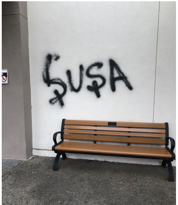
Name of a region in Artsakh taken by Azerbaijan in 2020 Karabakh War