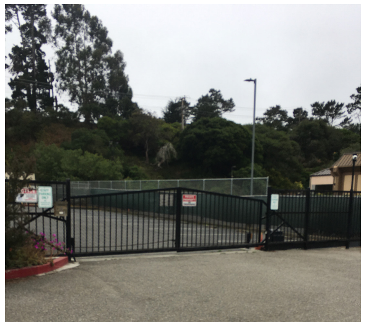
The KZV School is now protected by a fence separating the parking lot from the street, with an electronic gate allowing cars to enter.

Only a few months later, in the early morning hours of September 17, two assailants broke into the offices of the St. Gregory Armenian Apostolic Church, located just beside the church building itself. They brought two Molotov cocktails into the building with them and set both aflame in two of the offices as they evacuated the building. The resulting blaze destroyed most of the interior of the church office. Luckily, the priest at St. Gregory's, or the Hayr Sourp, was not in the office at the time of the attack. Miraculously, one of the only items from the offices that was not completely destroyed was a cross located in the Hayr Sourp's office, which somehow remained undamaged despite the devastation around it.