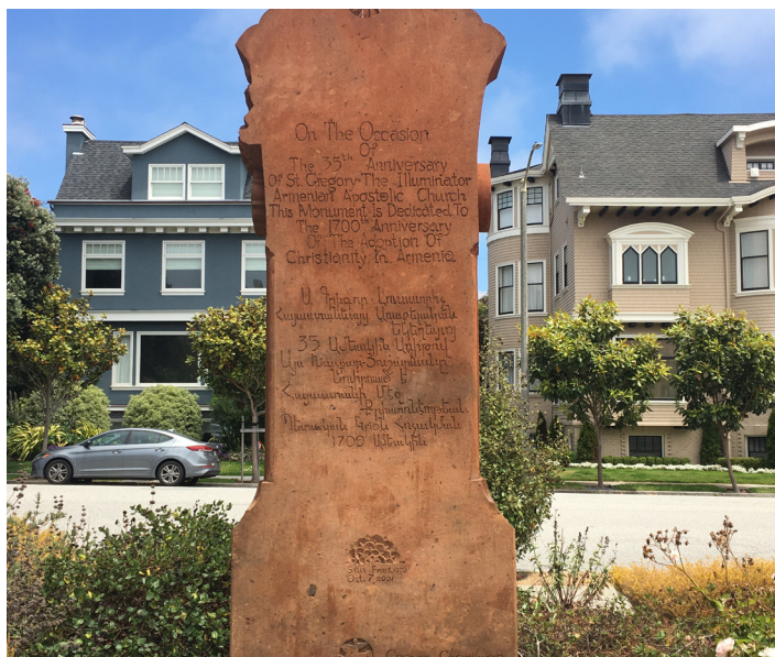
Cross stones, like the one pictured here outside of St. Gregory's Church in San Francisco, are a prevalent Christian symbol throughout Artsakh and Armenia. During the Karabakh War of 2020, hundreds of these stones were destroyed by Turkish-paid mercenaries and Azerbaijani troops, a destructive campaign that continues to this day.

Many Armenian Christians sought to rebuild their lives in other countries in the region, while others fled to Western countries hoping to escape the influence of Ottoman ideology altogether.