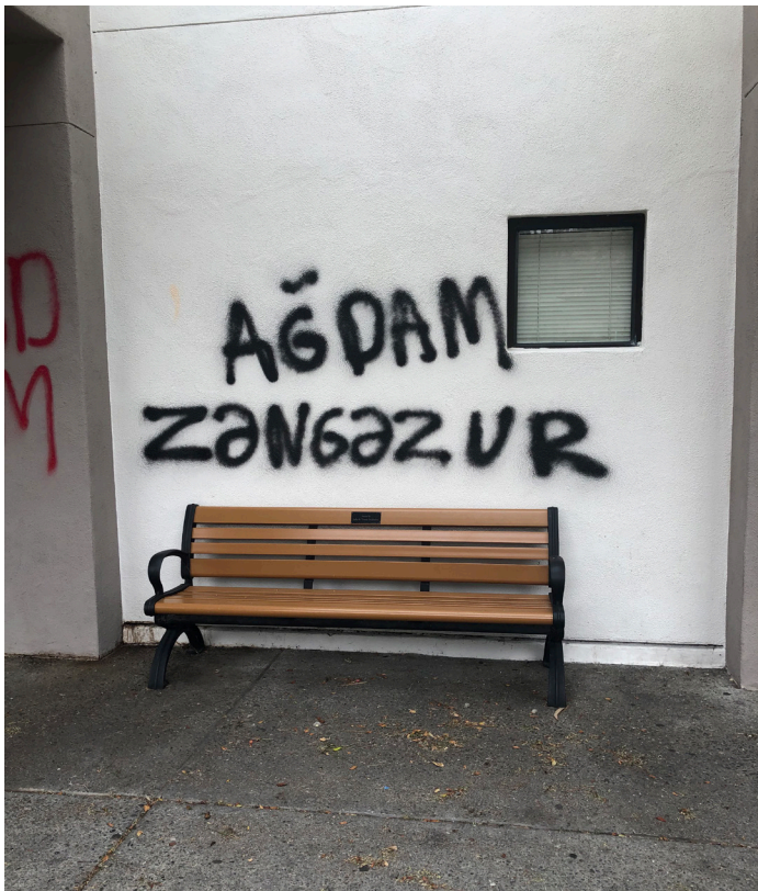
Name of a region in Artsakh taken by Azerbaijan in 2020 Karabakh War