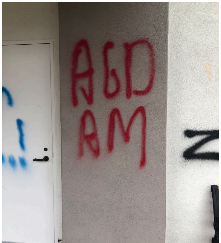
Name of a region in Artsakh taken by Azerbaijan in 2020 Karabakh War