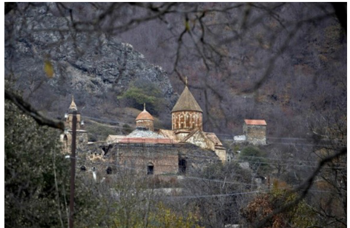
Dadivank Monastery is a centuries-old monastery in Artsakh that is now threatened by Azerbaijani control.

For example, Erdogan has used the phrase, “kılıç artığı” in public, which loosely translates to “leftovers of the sword” in English. Although many Westerners may not be privy to the meaning of this phrase, Erdogan’s Turkic audience around the world knows that this is a common slur used to refer to Armenians, in reference to the survivors of the Armenian genocide by the Ottomans in the early 20th century. Another Ottoman-era term that Erdogan has used to perpetuate anti-Armenian hate is “Kızıl Elma,” translated as “Red Apple.” This term is derived from an Ottoman legend regarding conquest, referring to the Red Apple as the next place that the