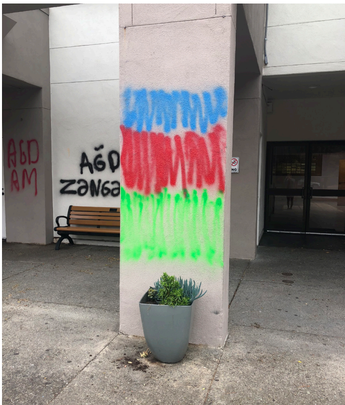
Colors of the Azerbaijani flag