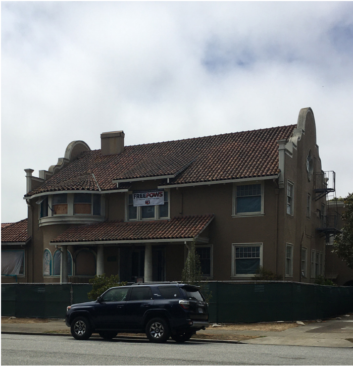
The building that housed offices and meeting spaces for St. Gregory's Church was severely damaged after the arson attack.