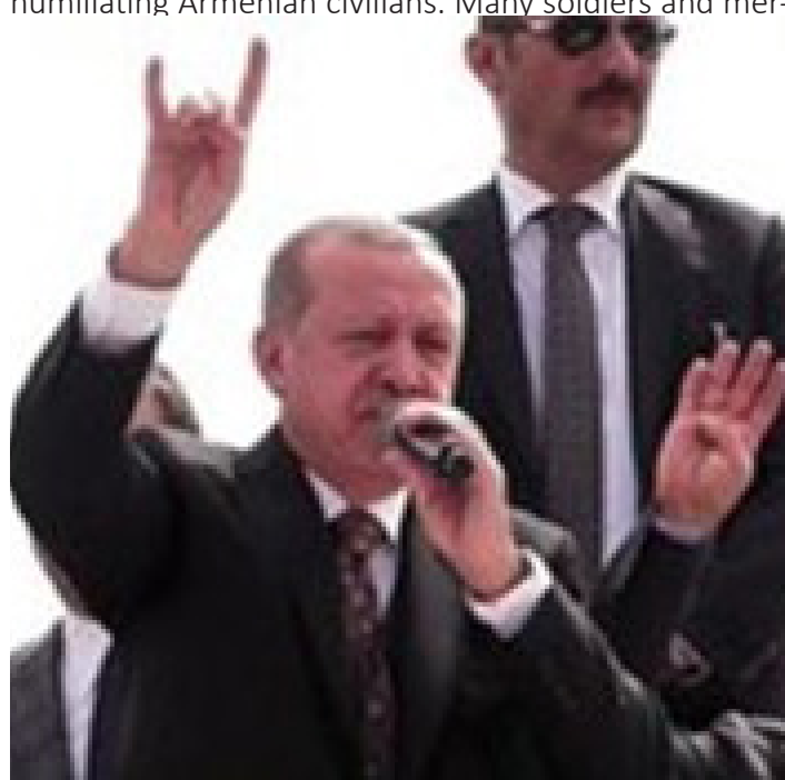
Turkish President Recep Tayyip Erdogan flashing the Grey Wolf sign during a public speech.

Although the fighting had stopped, what had transpired during the war echoed far beyond the battlefield, reminiscent of the Armenian genocide more than 100 years ago. Videos of Armenian soldiers and civilians being beheaded circulated on Turkish and Azeri social media channels. Azeri soldiers, alongside their mercenary counterparts, proudly posed for photo ops with Armenian corpses or for videos of them beating and humiliating Armenian civilians. Many soldiers and mer-