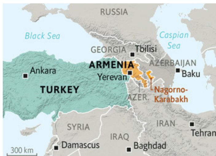
Armenia lies between Turkey and Azerbaijan, two countries united by their Turkic identity.

Although the Ottoman Empire eventually fell and was