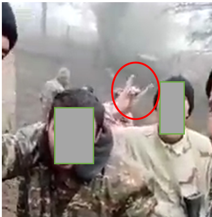
Azeri combatants flashing the grey wolf sign posing with a captured Armenian soldier.

At the crux of Armenian persecution is Nagorno-Karabakh, or Artsakh in Armenian, a small region located at the border of present-day Armenia and Azerbaijan. Despite Artsakh’s population being predominantly Armenian Christian, the USSR designated Artsakh as its own republic under Azerbaijani control while it was under Soviet rule during the mid to late 20th century. After the fall of the Soviet Union, the international community continued this recognition as being part of Azerbaijan, though Azerbaijan refuses to embrace the caretaker role of this region, resulting in Artsakh’s citizens forming their own government that is still internationally unrecognized.