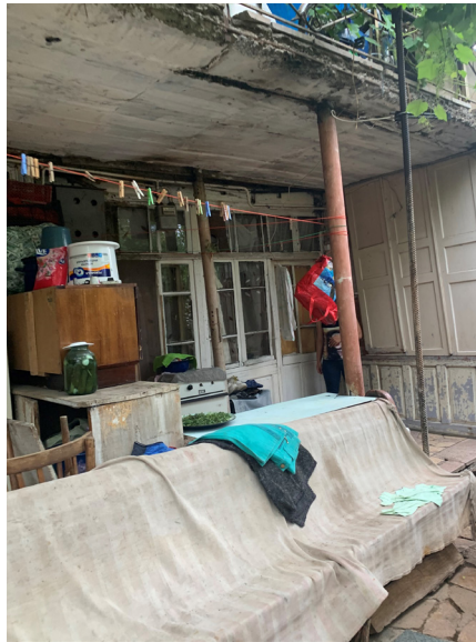
A home where the displaced are gathered

"I now feel desperate. I found out that my relatives are all alive, I had come to doubt that a bit. But now I am desperate about the uncertainty. Like when I need to clean the wall, I can't do it because I don't have the strength. I was connected to my home," said one displaced woman.