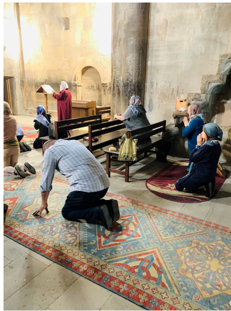
War victims pray at a monastery that remains under Artsakh's control

During the field trip, ICC frequently asked why displaced persons felt they could not return home. It was a question that always prompted tears from every family member: men and women, adults and children. The essence of the answers was always the same. "We will not be protected." "We cannot pursue our culture." "They will make us to become Muslim."