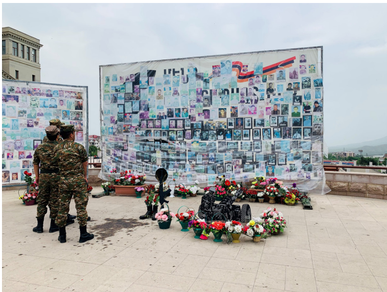
A memorial in Stepanakert of those killed in the war. Young boys and the elderly died defending their homes

On a separate but related note, ICC frequently encountered Syrian and Lebanese Armenian refugees during the field trip. Particularly in the case of Syrians, most