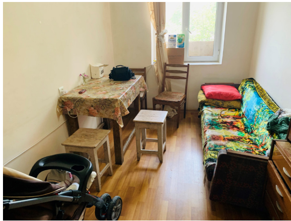
Living space for a displaced family of 4

In short, the outcome of Azerbaijan and Turkey’s policy of domination of Artsakh is one which sows continuous fear, shame, and helpless amongst those they displaced.