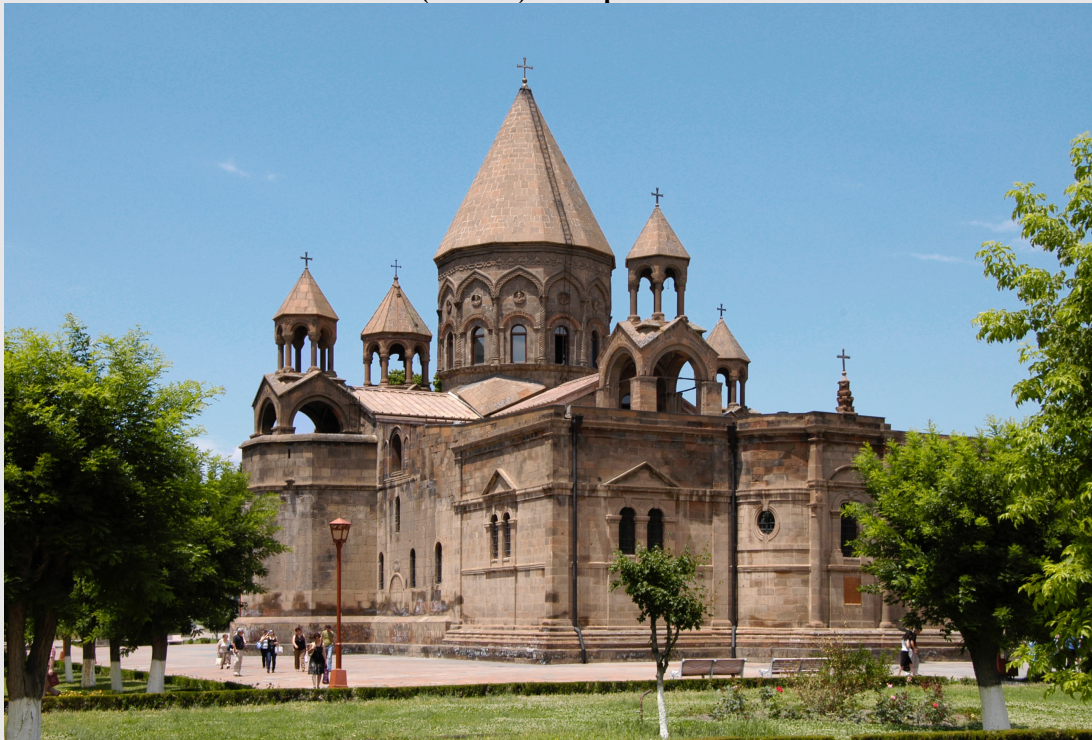
Etchmiadzin Cathedral (301-303): Birthplace of the Armenian Church

This report analyzes the contemporary conflict between Armenia and Azerbaijan over Artsakh considering the history of conflict between Christendom and Islam. The first section of this report studies the national and religious identity of Armenia and Azerbaijan, and its implications for understanding the present. The second section provides a timeline of the conflict from the origins in the early 20 th century to the fall of Artsakh in 2023. The report concludes with an assessment of the current situation in the context of centuries of Islamic persecution and dispossession of Armenian Christians. Knowing the sources of religious conflict rooted in national and religious identity and understanding the nature of persecution throughout history is necessary to respond effectively today.